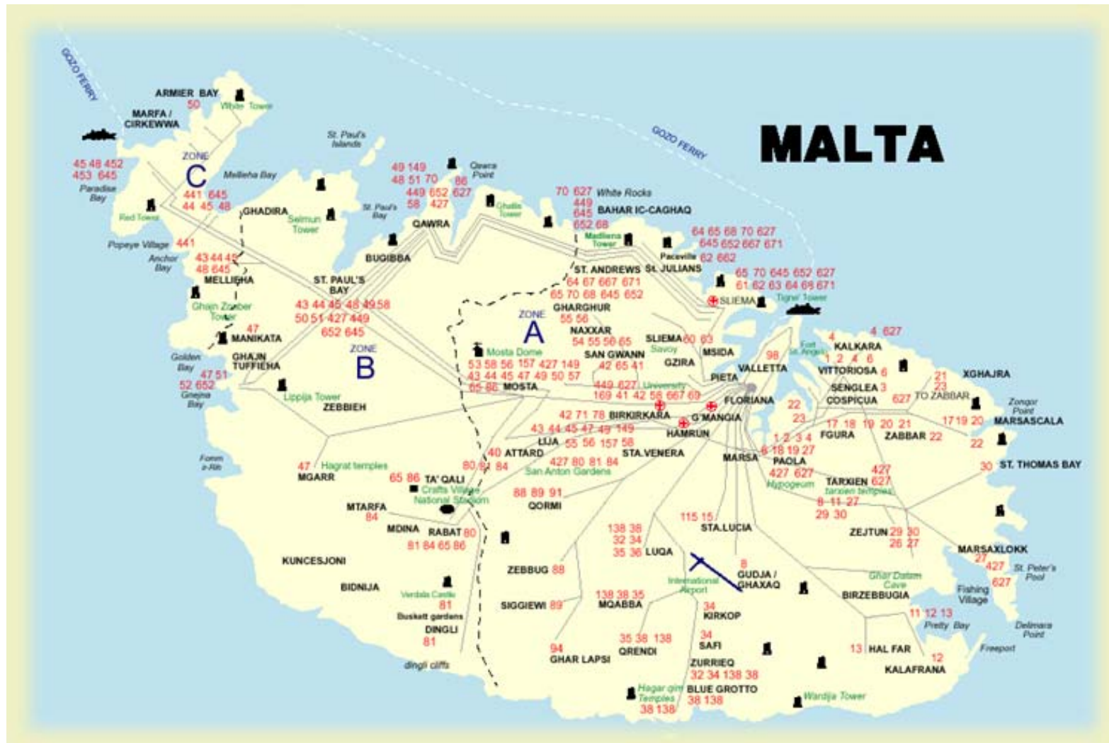
Figure 2: A Quick Guide to Bus Routes (not guaranteed for 2010; apologies for less-than-ideal rendering)