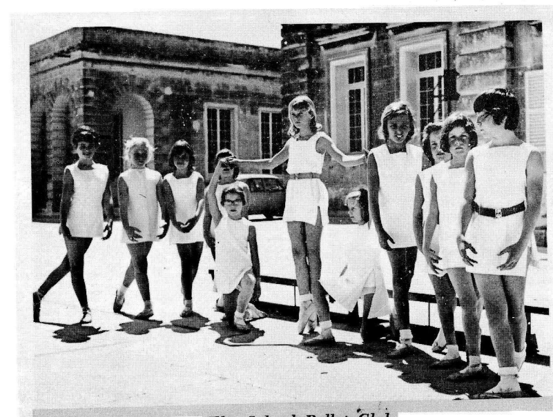
The School Ballet Club