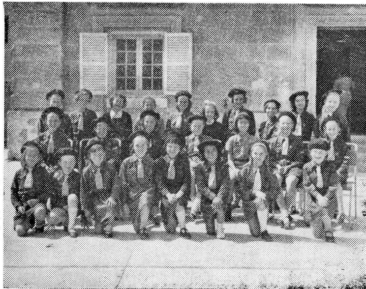
The Brownie Pack.

not one of these twenty. I was surprised that machine had not yet broken down.