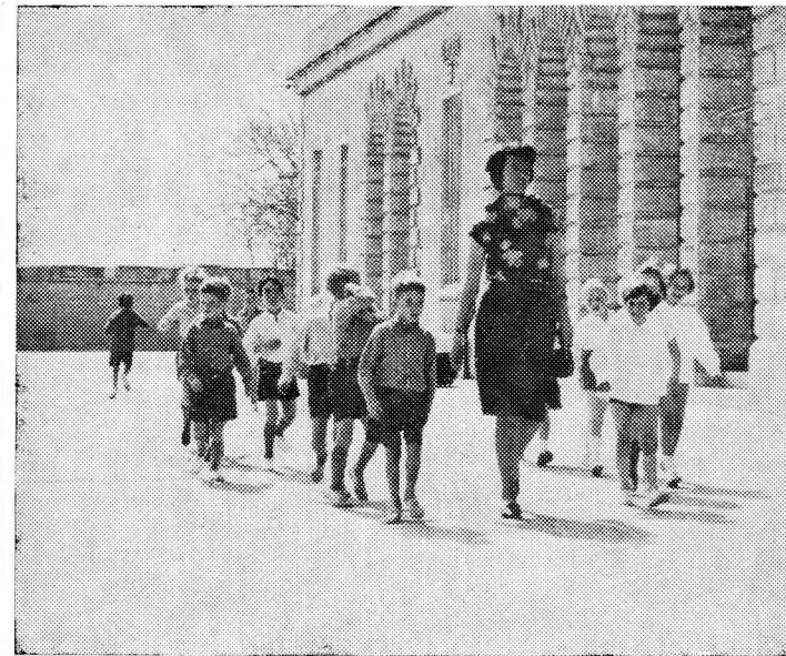
Infants 1 — Off to the Climbers.

Next morning the cars lined up for the "Old Crocks' Race" and as the flag went down I decided to keep a steady pace of fifteen miles per hour. There were fifty cars in the race and after a mile I was in twenty-sixth position. There were many strange squeaks and groans coming from the cars as they chugged and puffed over the quarter mark. Twenty of the cars had now stopped short or just fallen to pieces but my car was