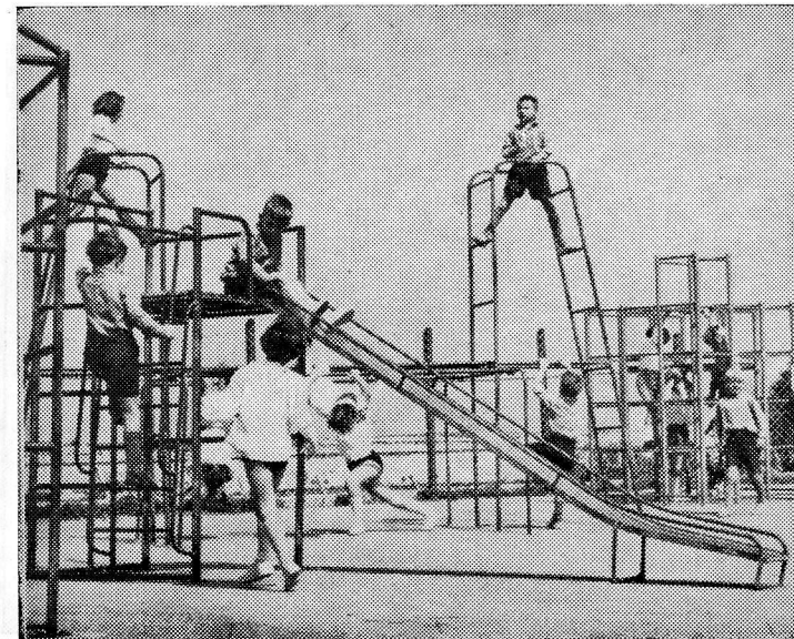
Infants 1 — On the Climbers.